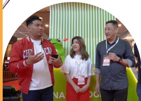
FHTB TV PROGRAMME

This Wine Masterclass programme is expected to motivate people to perfect their skills and helps widen knowledge of the sommelier profession in the public at large also with an aim of creating an educative short program to acknowledge everyone who is involved in the wine and F&B industry