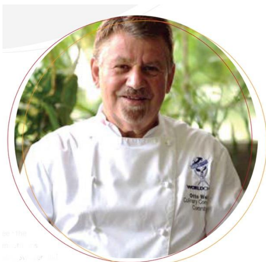
WACS Global Master Chef WACS Culinary Educator WACS Judge